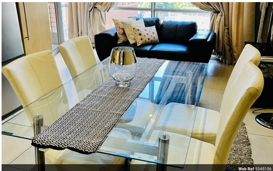
Web Ref 5345156

Huizemark Block 2A Bryanston Gate Office Park 170 Curzon Road Bryanston 2191